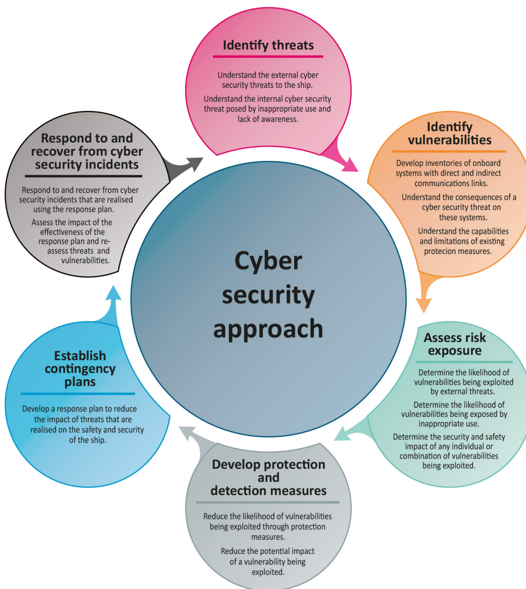
Figure 1. Cyber security approach as set out in the guidelines