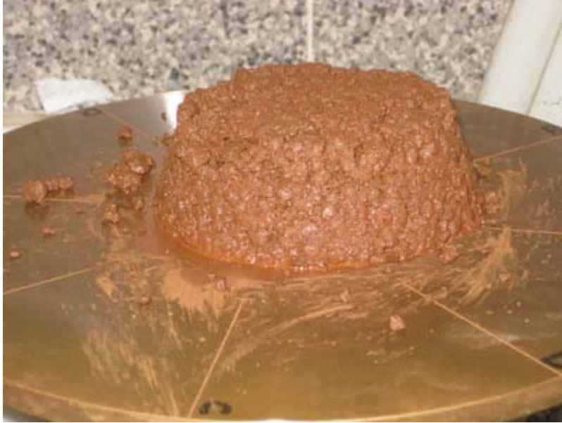
Flow table test.

For shipowners contemplating carriage of these cargoes, and for Masters instructed to load them, a major difficulty is that neither iron ore fines nor nickel ore have a specific listing in the IMSBC Code and thus it is not immediately obvious from consulting the Code that these are indeed cargoes that may liquefy. Unless he is already aware of the potential hazards from other sources, the Master is dependent on shippers correctly declaring the cargo as a liquefaction hazard. Although most shippers do indeed acknowledge that the cargo is a liquefaction hazard by supplying a moisture and TML certificate, albeit frequently flawed, some shippers do not, and without expert knowledge it is difficult for the Master to know that he should insist on a declaration of moisture and TML before allowing loading to commence.