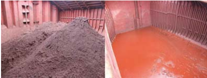
Iron ore fines before and after liquefaction.

Sampling for moisture content must take place not more than seven days prior to loading. Additional check tests should be conducted if there is significant rainfall between sampling and loading. 11