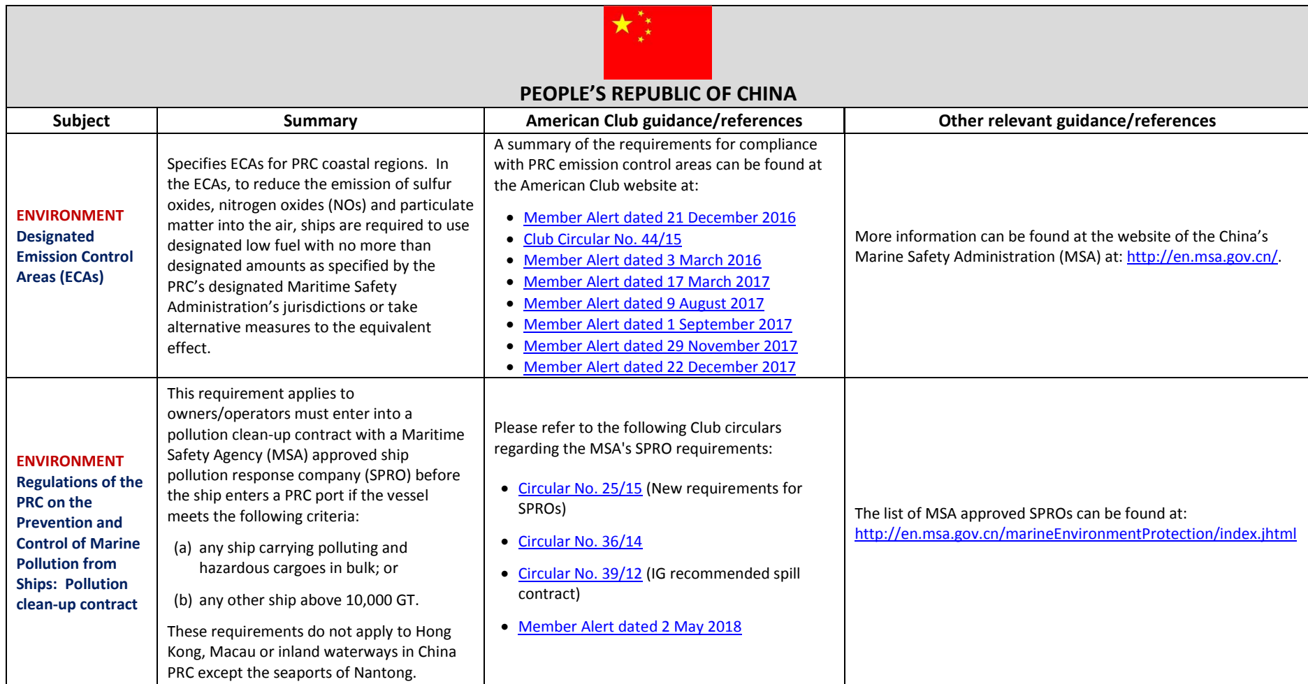
Table: Regulatory Regime for Greater China